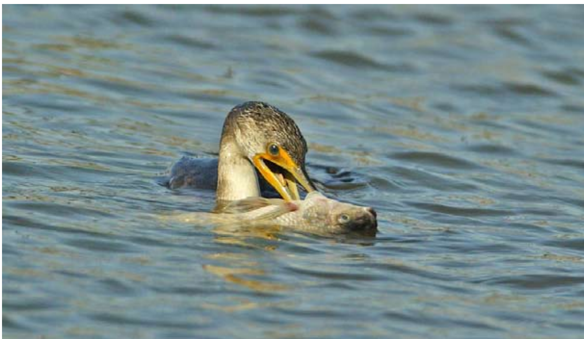
Figure 5. On this juvenile Double-crested Cormorant note the bare skin and color of the supra-loral and the pale throat and upper breast.