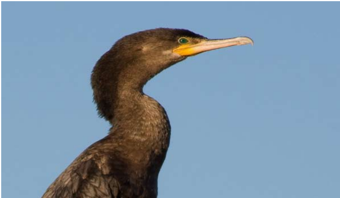
Figure 4. On this juvenile Neotropic Cormorant the yellow orange gular pouch is similar in color to that of a typical Double-crested Cormorant, but note the color and feathering of the supra-loral and the dark breast.

The identification of juveniles of both species can be challenging. These birds share many of the differences noted above for adults, especially the shape of the gular pouch and differences in the supra-loral. Juveniles of both species are lighter and browner than adults. Juvenile Neotropics are usually a fairly uniform dark brown with at most only slightly paler underparts. Juvenile Double-crested usually have light gray breasts which are sometimes paler gray on the upper breast, neck, and throat. Some juvenile Neotropics are especially challenging because they may have facial skin color that is brighter than adults (Clark 1992) and, therefore, more closely approach Double-crested. A key feature in separating these juveniles is the supra-loral which is dark feathering in Neotropics, but is fairly bright orange-yellow or yellow-orange bare skin and uniform in color with the gular pouch in Double-crested (figures 4 & 5; Patten 1993).