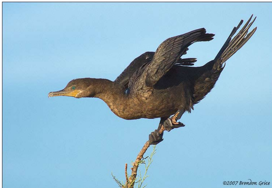
Figure 1. Adult Neotropic Cormorant, Gilbert, AZ.

The Neotropic Cormorant ( Phalacrocorax brasilianus ) is suitably named given it is the only cormorant ranging over the entire neotropics. Although it is widespread throughout most of the western hemisphere, in the U.S. it is found primarily along the Gulf States of Texas and Louisiana, north locally to Kansas, and in south-central New Mexico. The species is sedentary throughout most of their breeding range, with widespread post breeding dispersal (figure 1).