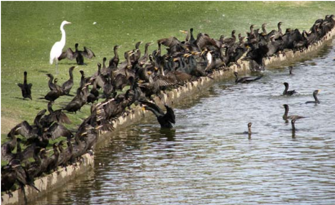
Figure 3. Congregation of about 100 cormorants, mostly Neotropic with several Double-crested Cormorants at Kokopelli Golf Course in Gilbert, AZ.

In Arizona, Neotropic Cormorants prefer fresh water lakes, ponds, lagoons, and slow moving rivers containing large densities of fish with available trees, snags, islands, or open banks for loafing. In Maricopa County the species has become common to locally abundant in some urban lakes and ponds in the greater Phoenix area, as well as along perennial sections of the lower Salt and Gila rivers downstream to Gillespie Dam. Several concentration areas have already exceeded 500 individuals (figure 3). The highest densities have been observed at several residential lakes in Chandler and Gilbert, just upstream of Tempe Town Lake, and several gravel extraction company lakes on the Salt and Gila Rivers. However, it should be noted that the specific concentration locations are often temporary and are based on abundant populations of appropriate size fish. Once prey populations are reduced, these highly mobile cormorants readily move to other neighborhood lakes and ponds.